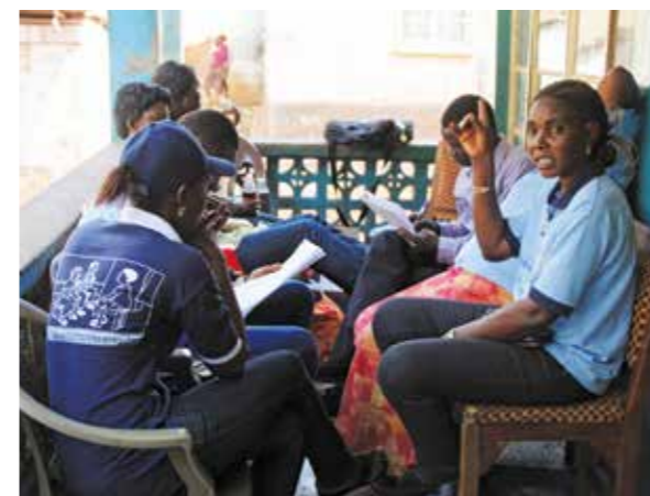
Focus group of community health workers in Thunder Hill, Sierra Leone, February 2015.

This report is based on interviews and focus group discussions that Oxfam conducted in Liberia and Sierra Leone in February 2015. In Sierra Leone, 23 focus group discussions and 30 individual interviews were conducted across both urban and rural parts of Western Area and Koinadugu district. In Liberia, 10 focus groups and 18 interviews were conducted in New Kru Town, Clara Town and West Point, Montserrado. In Liberia, Oxfam also conducted a survey to assess the economic impact of Ebola. This was carried out in December 2014 and involved 1,600 people from Montserrado, Nimba and Grand Gedeh counties.