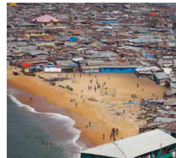
West Point, a township in Monrovia, Liberia, where Ebola spread rapidly through the densely-packed slums.

People spoke of the thousands of health volunteers and community initiatives that have been at the heart of tackling Ebola, many of which received active local government support. This is seen as a new network that could be built upon in the future. People are calling for continued support for these community initiatives, both to help eradicate Ebola, and to ensure they are at the heart of the recovery.