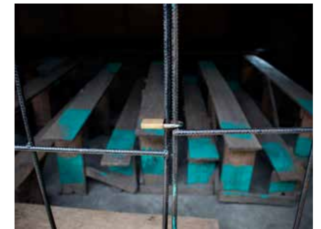
A school in West Point, Monrovia which has been shut during the Ebola outbreak.

A clear programme for the rehabilitation of schools is necessary, including improvement of facilities and continued awareness of good hygiene practices. Parents want desperately to send their girls and boys back to school to get the quality education that they need, but there are fears that schools may not be safe. The universal drive to give children a brighter future has been intensified for many people – as they have seen the damaging consequences of school closures, including a rise in teenage pregnancies. From listening to communities, Oxfam heard various reasons for this, including girls being driven to prostitution after their parents had died.