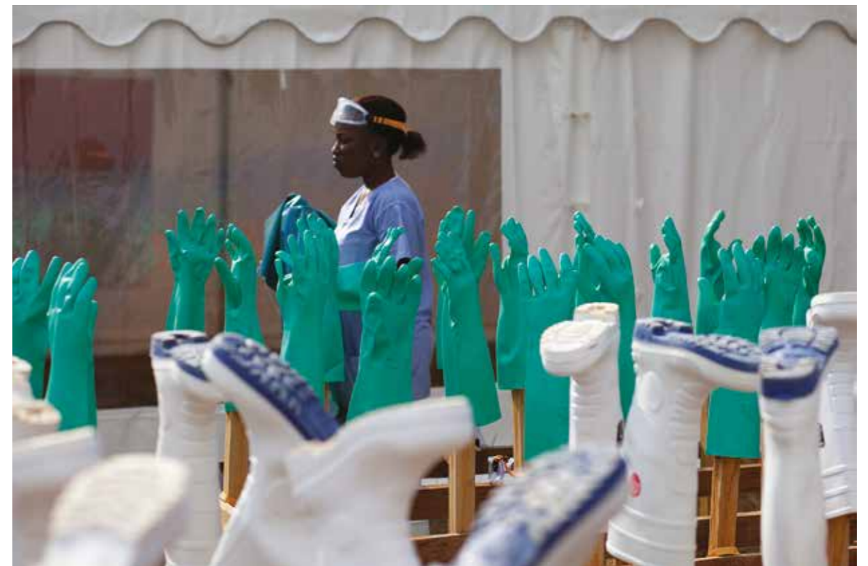
One of Sierra Leone's Ebola health workers, Masiaka Community Care Centre, near Port Loko.