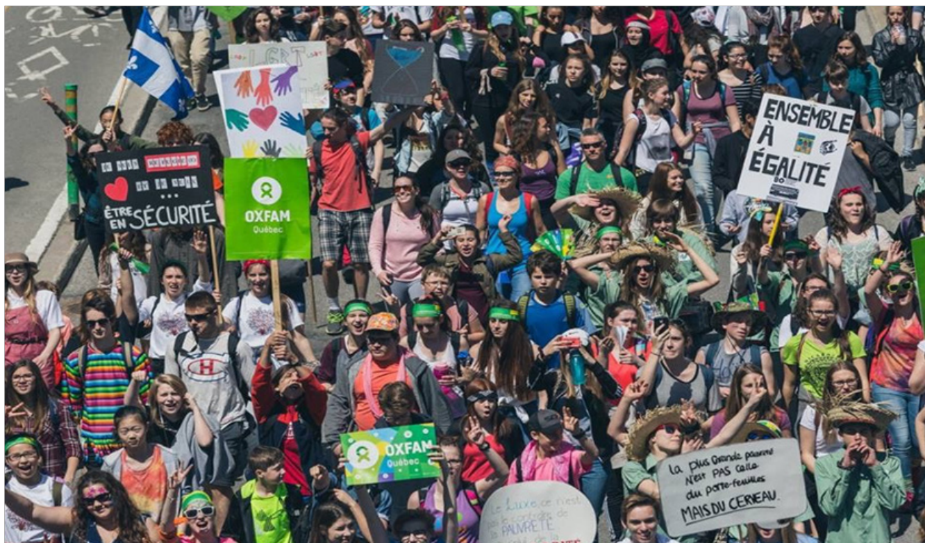
Photo: Ulysse Lemerise/Oxfam-Québec. Marche Monde, Montreal 6 May 2016.