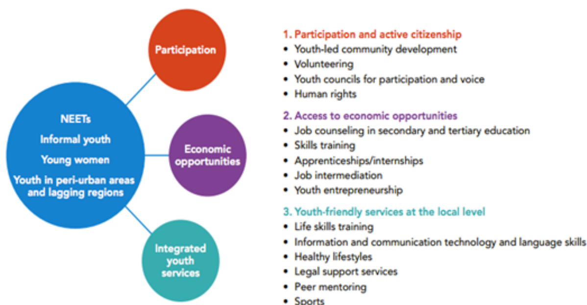
Figure 2: Multidimensional Policy for Youth Inclusion

local level. Such a holistic approach could help promote greater equity for youth and facilitate their meaningful participation in economic life.