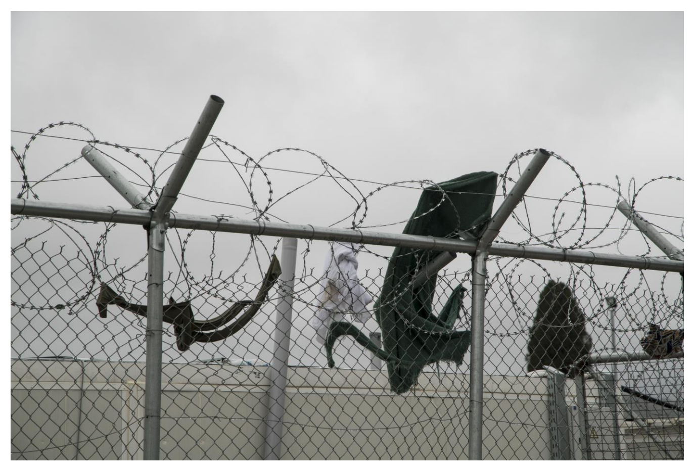
Barbed wire fences surrounding the refugee reception facilities on the islands.