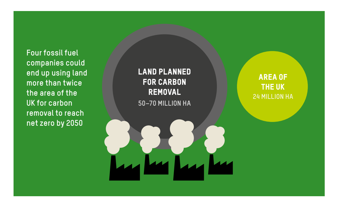
Figure 2: Estimated land needed for carbon removals by four energy companies to meet net zero targets

If all energy companies were to set similar net zero targets by 2050, and even if 15% of that was met through land-based removals, the energy sector could end up using 500m ha of land by 2050 to meet net zero goals – an area that is roughly half the size of the United States and significantly more than the land available for carbon removal that would not compete with crop production.